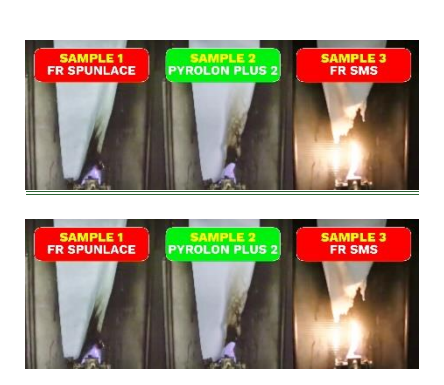
A video, showing the relative performance of different SFR fabrics when contaminated with a light oil, can be viewed here.

environment and how they might affect overall thermal protective performance. As a safety measure, a -good rule of thumb is to not continue to use contaminated SFR workwear, but to replace it with clean garments regularly.