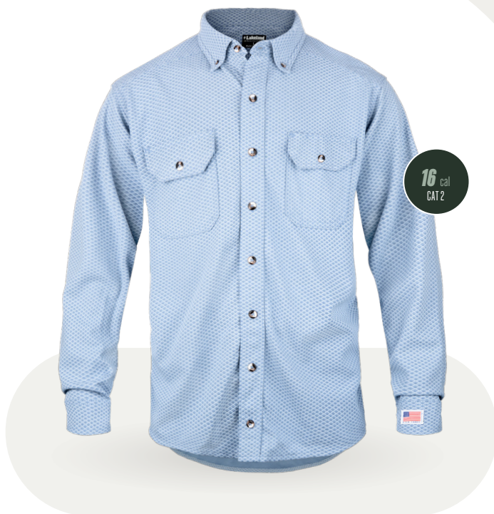
ISHATP09 CAT 2, 16 cal/cm 2 DIAMOND PRINT DRESS SHIRT, LIGHT BLUE