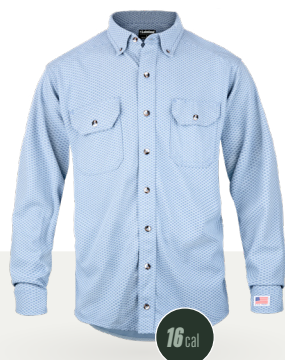
ISHATP09 CAT 2, 16 cal/cm 2 DIAMOND PRINT DRESS SHIRT, LIGHT BLUE