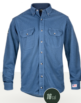
ISHATP12 CAT 2, 16 cal/cm 2 DIAMOND PRINT DRESS SHIRT, DARK BLUE