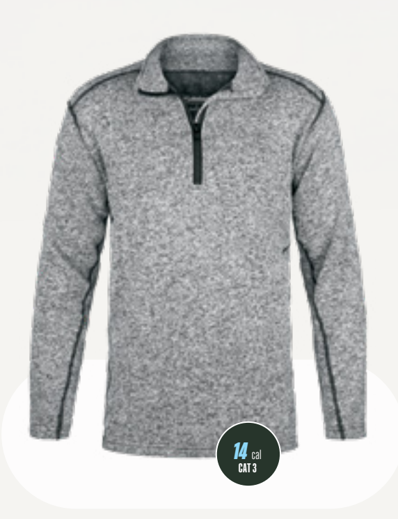
LSCSKO6 CAT 3 HPFR SWEATER KNIT PULLOVER, HEATHER GRAY

Lakeland HPFR apparel takes moisture wicking to the next level, working to ensure you feel dry and comfortable all year long.