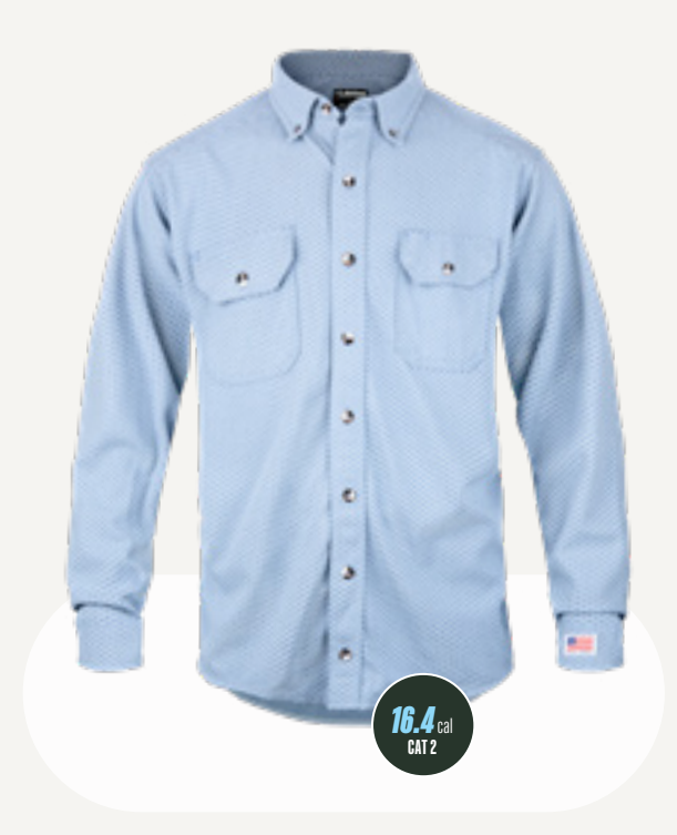
ISHATPO9 CAT 2 DIAMOND PRINT DRESS SHIRT LIGHT BLUE