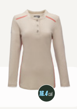
HSAT20 CAT 2 Women's 3-Button long Sleeve Henley