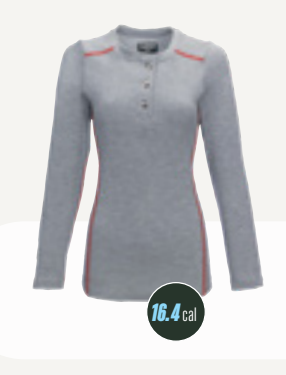
HSWATOG CAT 2 WOMEN'S 3-BUTTON LONG SLEEVE HENLEY