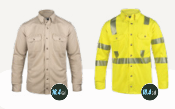
ISHAT20 CAT 2 HPFR KNIT BUTTON-UP, KHAKI