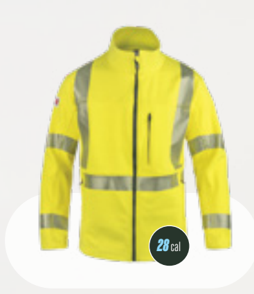
IJK12ANT29RT CAT 3 HPFR HI-VIS ZIP-FRONT JACKET HI-VIS YELLOW