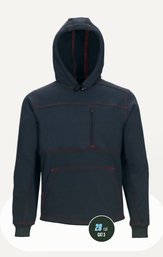
IHDP12ANT CAT 3 HPFR PULLOVER HOODIE, BLACK