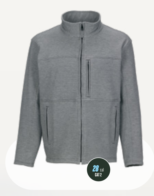
IJKT12ANTO6 CAT 3 HPFR ZIP-FRONT JACKET, HEATHER GRAY