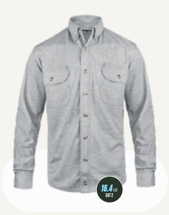
ISHATO6 CAT 2 HPFR KNIT BUTTON-UP, , GRAY