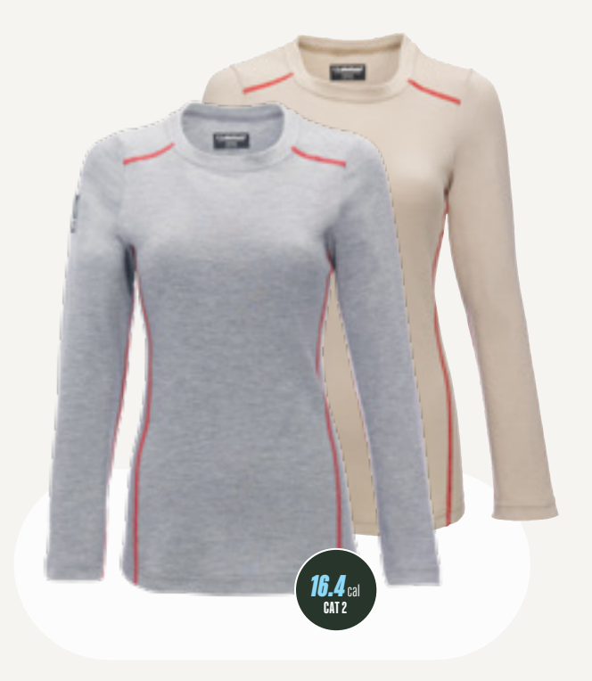
LSCWATO6, LSCWAT20 CAT 2 WOMEN'S LONG SLEEVE CREW