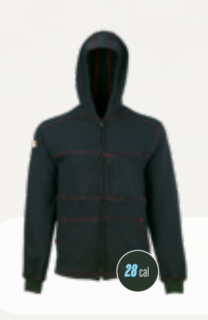
IHD12ANT CAT 3 HPFR ZIPPER FRONT HOODIE BLACK