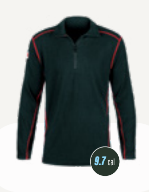
LSCMWZ CAT 2 WAFFLE CUT FR QUARTER ZIP BLACK

WAFFLE CUT HI-VIS HOODIE W/ NECK GAITER, HI-VIS YELLOW Waffle cut fr hoodie w/ neck gaiter, Black