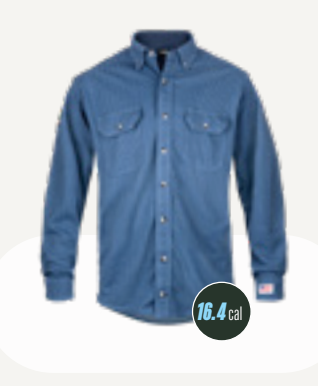
ISHATP12 CAT 2 DIAMOND PRINT DRESS SHIRT DARK BLUE