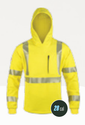
IHDPANT29RT CAT 3 HI-VIS PULLOVER HOODIE HI-VIS YELLOW