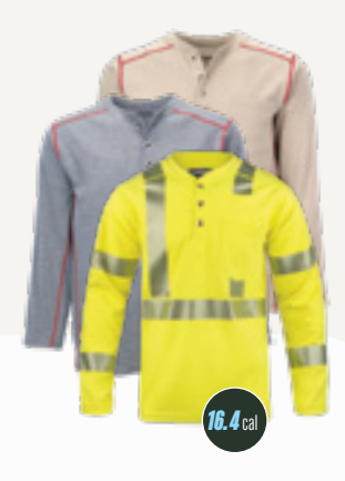
HSAT29RT, HSAT CAT 2 3-BUTTON LONG SLEEVE HENLEY HI-VIS YELLOW, GRAY, KHAKI