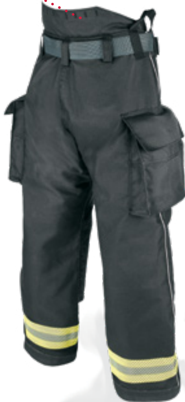
Style BP3307G91 shown above in Standard B2 Material Configuration