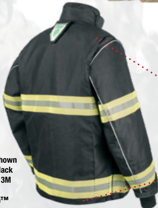
Style BP32 shown in optional Black Pioneer with 3M Segmented Comfort Trim ™

Pleated shoulder and back goes from the top of the shoulder to the hem of the coat for maximum mobility