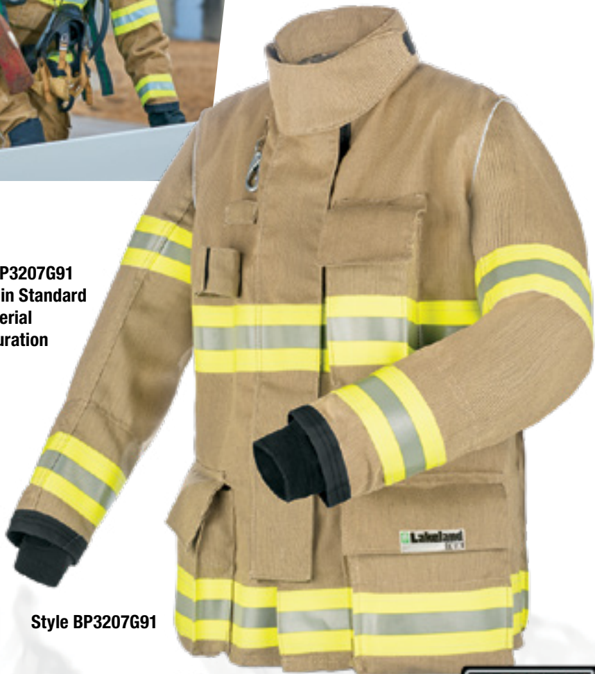
Style BP3207G91 shown in Standard B2 Material Configuration