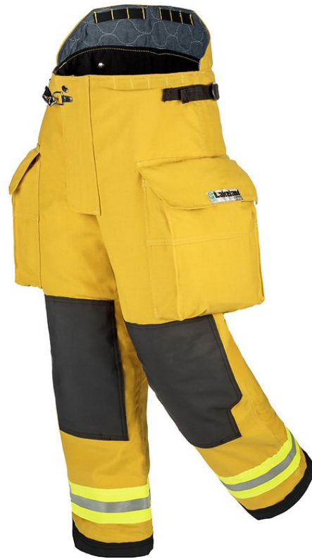
Style OSX BA3302Y shown in Standard OSX B10 Material Configuration