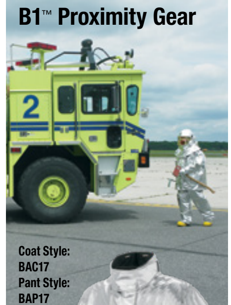
Coat Style: BAC17 Pant Style: BAP17