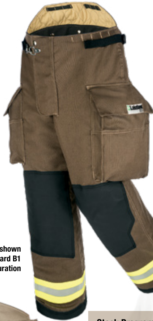
Style BA3307K98 shown right in Standard B1 Material Configuration