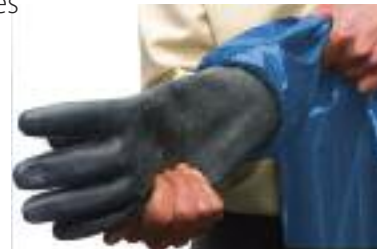
Standard neoprene / North Silvershield® system