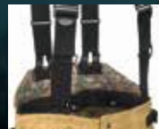
Black-Ops™ Multi-Adjust Suspender System

Compliant to the new 2013 Edition NFPA 1971