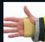
Extended Kevlar® Sleeve with Thumbhole