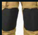
Knee Expansion Pleats