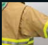
Pleated Back gives freedom of movement

Compliant to the new 2013 Edition NFPA 1971