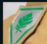
"Easy Grip" Drag Rescue Device