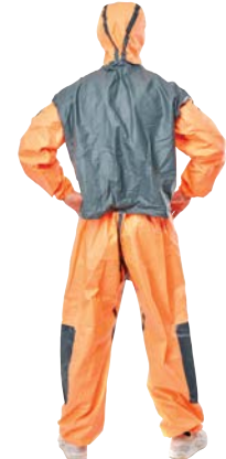
MicroMax® NS Cool Suit