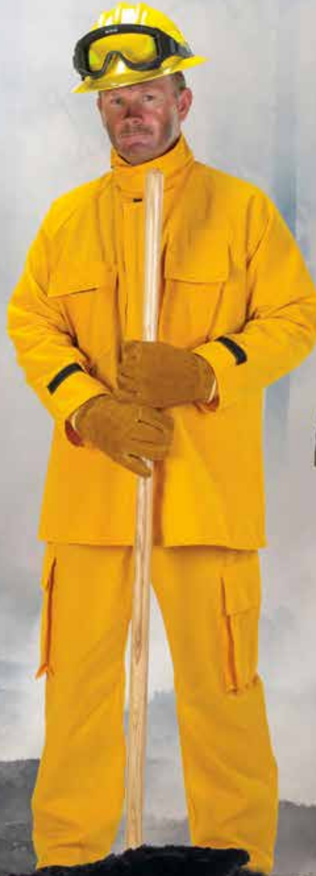
6 oz. Nomex®