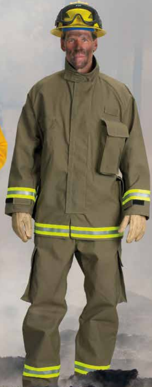
Khaki Advance® with optional 2" trim around lower sleeves, coat bottom and lower legs, optional mic clip.