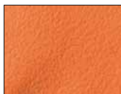
02- Sand patch Finish