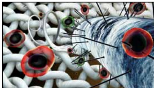
In this magnified view, the positively charged surface of MicroGard® attracts the negative charged bacteria. Due to the electrical attraction, the bacteria is drawn into the molecular spikes which puncture the bacteria membrane, killing it.