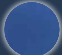
Royal* (1 piece suit only)